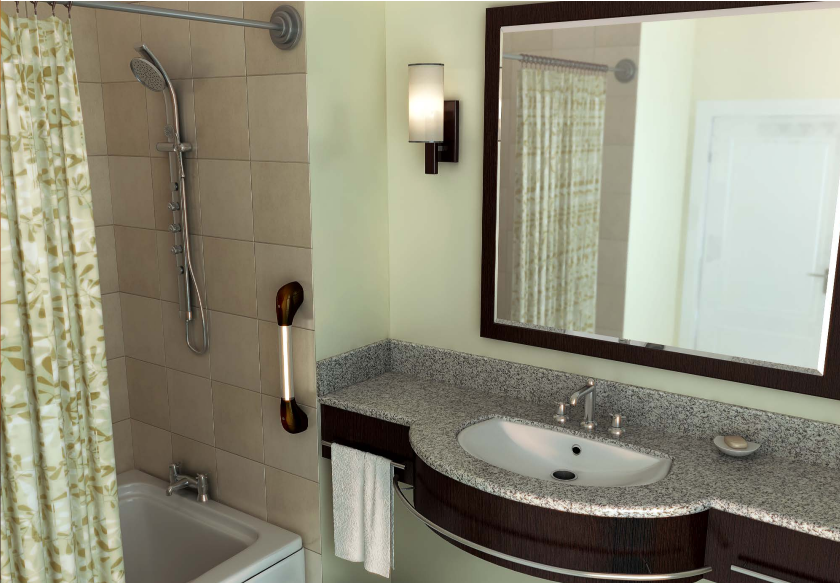
Luna LED Flex Light

The Luna LED flex light provides a soft diffused light that will enhance any homes interior. It's inherent flexibility, low profile and ease of installation allow for use in almost any application, including counter tops, toe kicks, and baseboards. Luna is available for installation with 3M adhesive tape or mounting channel and rated for wet applications. The diffusion provides even, glare free illumination, while providing the necessary contrast needed to guide those with poor eye sight or cognitive impairments.