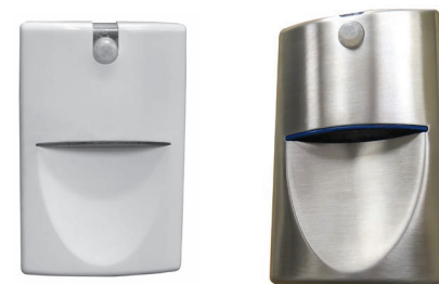
Navi Night Light

The standard version can be specified with polished or brushed stainless steel end caps. It is available in multiple lengths with a cool white LED.